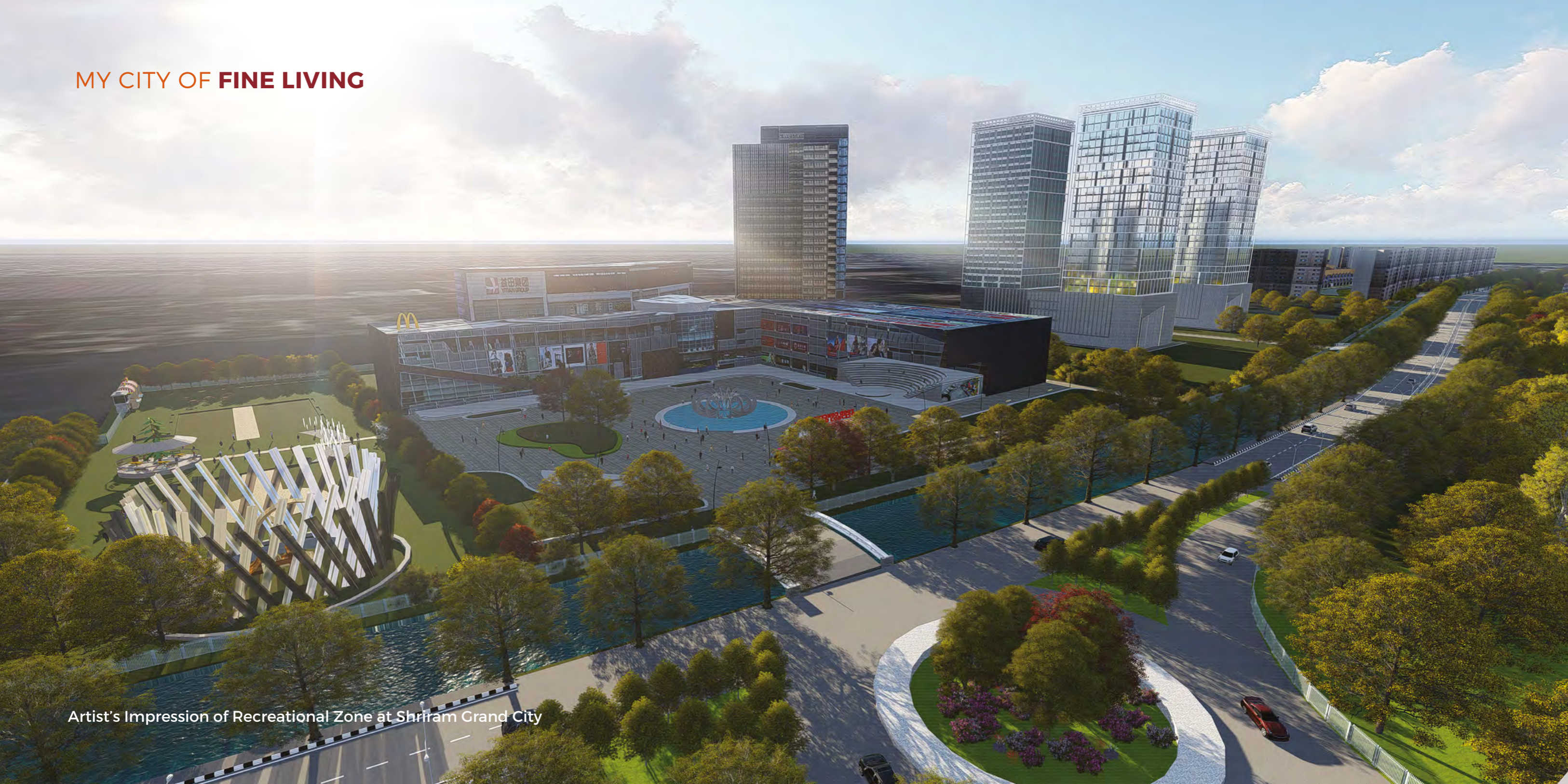
Artist's Impression of Recreational Zone at Shriram Grand City