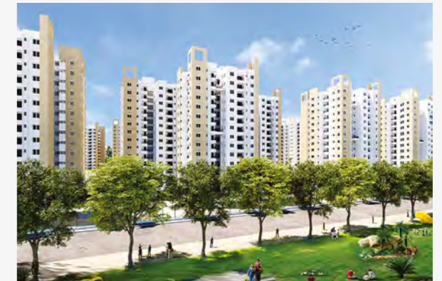
A 314 acre mega city under development in Kolkata.