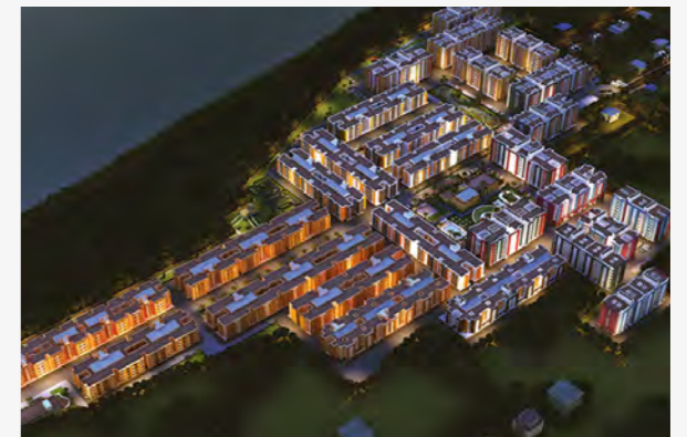
2 projects delivered/under construction in Chennai. On an aggressive spree with 5 new projects in the pipeline.