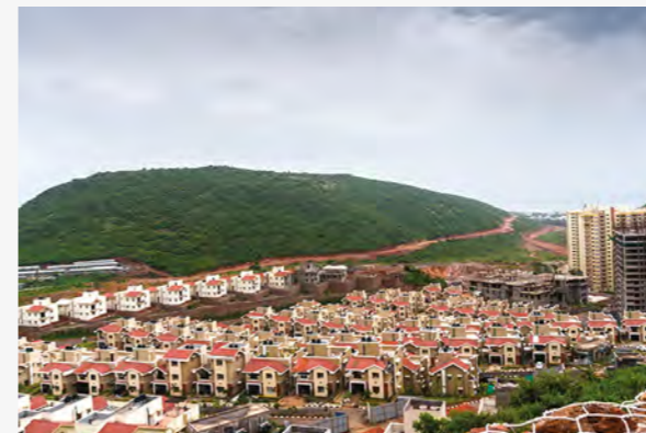
Vizag's most premium address. Phase 1 - delivered.