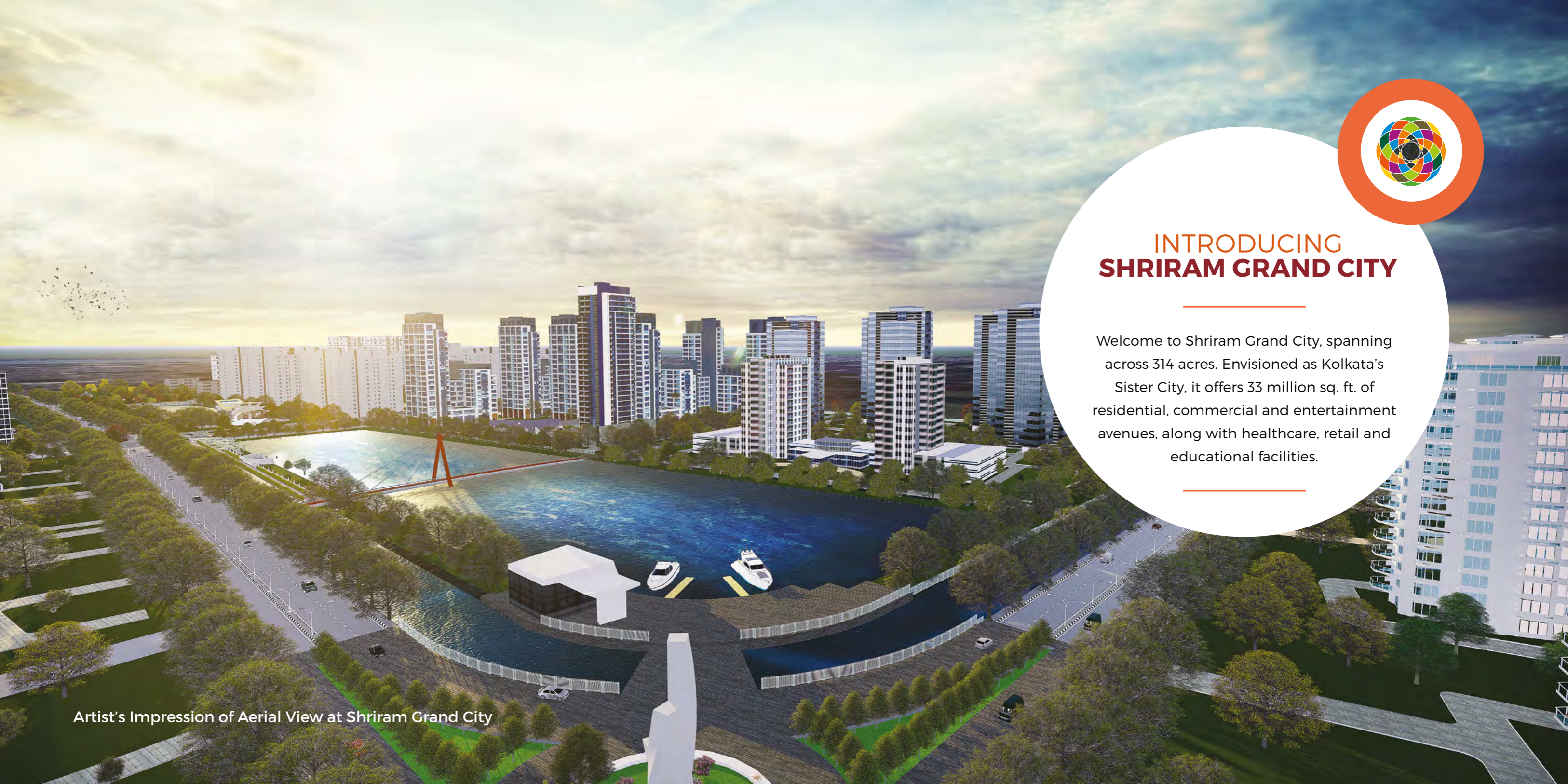
Artist's Impression of Aerial View at Shriram Grand City

Welcome to Shriram Grand City, spanning across 314 acres. Envisioned as Kolkata's Sister City, it offers 33 million sq. ft. of residential, commercial and entertainment avenues, along with healthcare, retail and educational facilities.