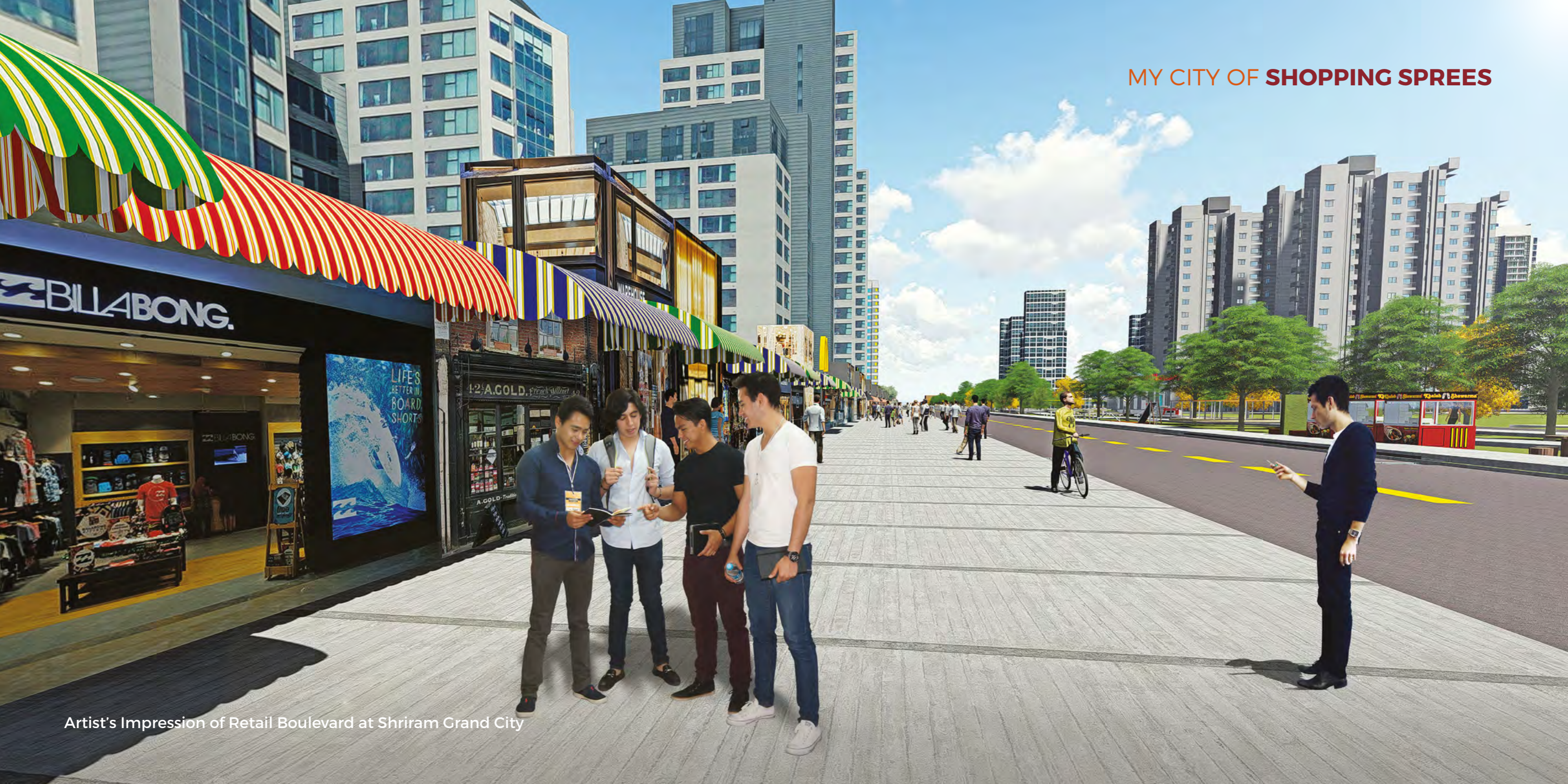
Artist's Impression of Retail Boulevard at Shriram Grand City