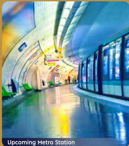
Upcoming Metro Station