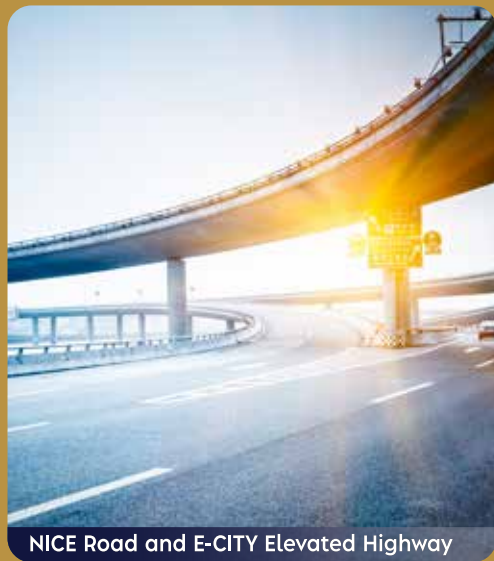
NICE Road and E-CITY Elevated Highway